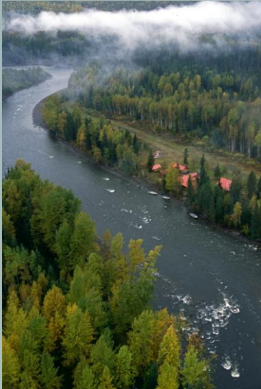
Silver Hilton – Main Camp