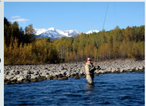
Jeremy Myers with one hooked