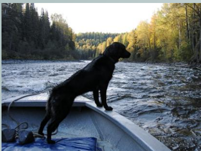
Even mans best friend, Maggie, enjoys a day on the river