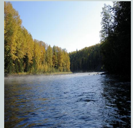
The Beautiful Babine River

Our anglers are also more aware of the issues and, in the best sense of the word, they have evolved into a much better informed, caring and wiser angler than our guests had been in the early years. So, it seems that we have changed, we have grown up and we are indeed where we want to be – protecting a river we love and care about. ☺