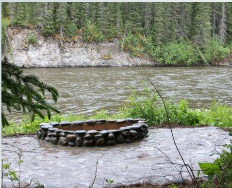
Triple Header's new

Check out our Website www.silverhilton.com for photographs from previous years.